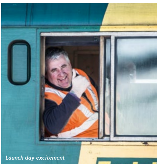
Launch day excitement

The Borders railway Opening Celebrations Committee (BROCC) would like to thank everyone who submitted their ideas for the opening ceremony.