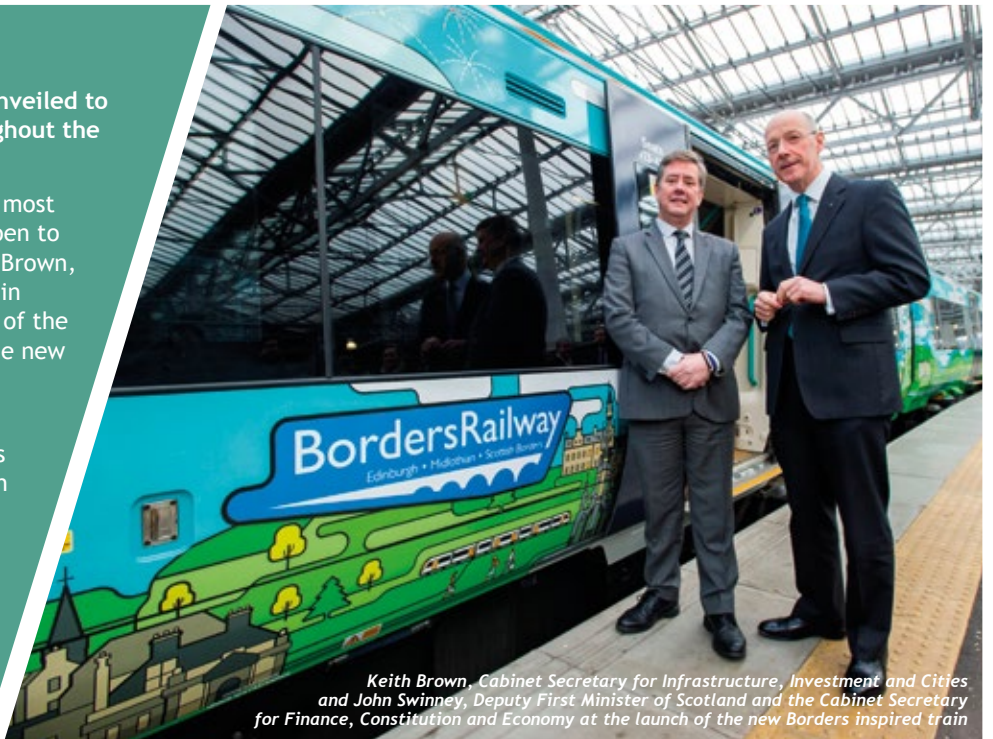
Keith Brown, Cabinet Secretary for Infrastructure, Investment and Cities and John Swinney, Deputy First Minister of Scotland and the Cabinet Secretary for Finance, Constitution and Economy at the launch of the new Borders inspired train

It features illustrations of Edinburgh Zoo's beloved pandas, Midlothian's famous and historic Rosslyn Chapel and the Scottish Borders' world-class scenery.