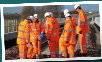
Engineering students from Falkirk High

The visit was part of a project being carried out by the pupils to design an optimal loop length for the Highland Main Line as part of the Engineering Education Scheme (EDT), the largest provider of STEM (science, technology, engineering and mathematics) activities for 11-21 year olds across the UK.